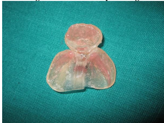
Figure 6- Post operative