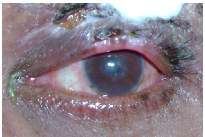
Fig 2. Resolving Disciform keratitis

In our study, Cornea stood out as the most common ocular structure involved (62.5% of cases) followed by the uveal tract (in 37.5% cases).