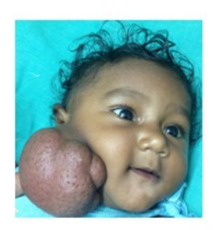
Fig.1 Nevus Sebaceus of an Infant