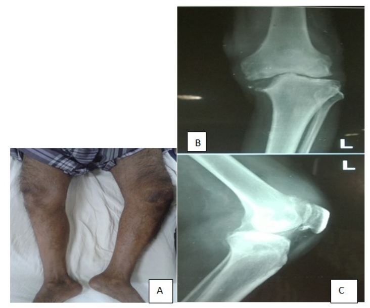
Figure 1(a,b,c): Clinical photo before surgery showing severe varus deformity of the left knee(a).Pre-opanteroposterior Xray showing medial tibial defect on left knee (b).Pre-op Lateral view of left knee

This study describes the treatment and outcome of using autograft for reconstructing large medial tibial defects (>5mm) using Sculco's technique.