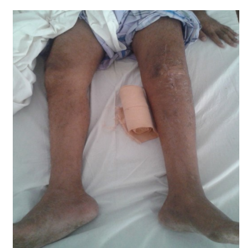
Figure 4: Post operative clinical picture showing he deformity being corrected with healed scar in the midline.