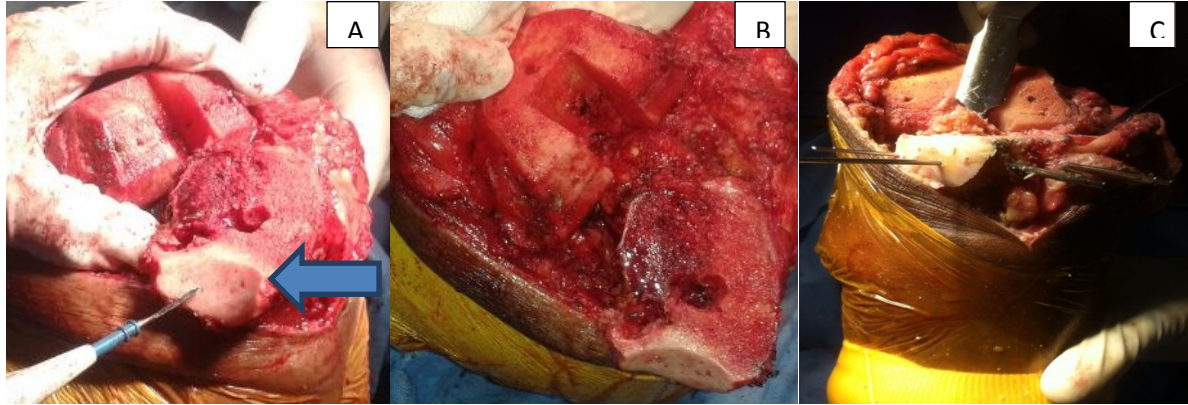
Figure2(a,b,c): Blue arrow shows the defect in the medial aspect of tibia(a).Axial view showing the medial defect(b).Graft from the femoral cuts fixed with two K wires(c).

65 year old male patient came to us with severe pain over the left knee since 10 years with difficulty in walking more than 20 feet without support. He also had difficulty in squatting, sitting crossed leg and climbing stairs. Clinically patient had medial joint line tenderness. He had varus deformity of 20 degrees and fixed flexion deformity of 15 degrees. Theflexion was noted to be 15 to 70 degrees beyond which it was painful. Standinganteroposterior and lateral radiographs of the knee were taken which showed a Type 3 of Anderson Research Institute Classification. After evaluation patient was posted for total knee replacement through routine medial parapatellarapproach. On exposure the medial tibial defect was noted to be a slope measuring 25mm. Routine femoral and tibia cuts were made. Tibia was cut 8mm measured from the unaffected lateral plateau. The defect on the tibia was sclerosed, which was cut obliquely to freshen the edges for graft incorporation<sup>2</sup> (Sculco's Technique). From the femoral cuts, bone was fashioned to fit into the defect remaining after the tibial cuts defect was measured to be 15mm.