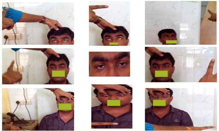
figure 1: showing complete absence of horizontal eye movements

An uncommon case of horizontal Gaze Palsy with scoliosis and associated brain-stem anomaly