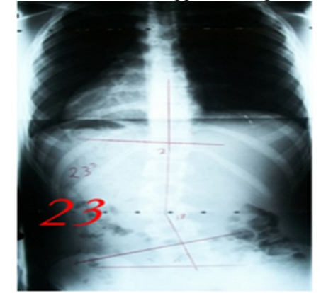
figure 4: X-ray spine AP view showing Cobb angle 0f 23<sup>0</sup> with apex at D10

Plain radiograph of spine in AP projection showed thoraco-lumbar scoliotic deformity with convexity towards left side with apex at D10 vertebral level and had Cobb Lippman's angle of 23<sup>o</sup> (Fig. 4).