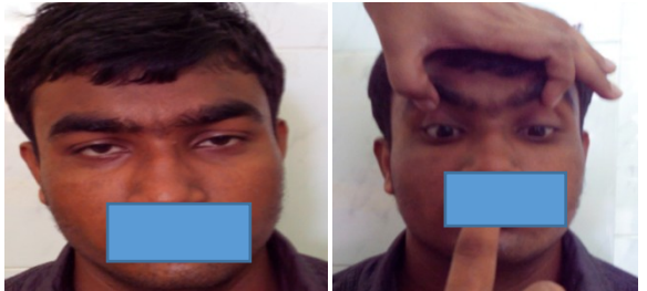
figure 2: showing normal convergence

MR imaging revealed T1 hypo and T2 hyperintense deep midline extending ventrally from floor of 4th ventricle across the Pons giving "SPLIT PONS SIGN" and extending inferiorly upto superior medulla oblongata. Hypoplasia of pons and medulla were noted. There was absence of facial colliculi with tenting appearance of floor of the fourth ventricle. Rectangular shaped medulla oblongata was noted with deep anterior median sulcus. Atrophic changes of anterior protuberances of medulla oblongata were noted with more prominence of olivary protuberances(Fig. 3).