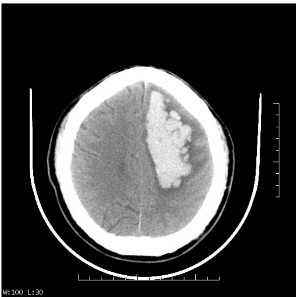
Figure 1: Computerized axialTomographic brain of a 36 year-old male with history of acute mild head injury. Ct findings show moderateleft intracranialhaemorrhage with edema.

A Bright speed 4 slice helical CT scanner was used to acquire the images for the study. Non contrast axial slices were taken from the base of the skull to the vertex at 5mm intervals and post processing of images involving reconstructions were done where necessary. All results were interpreted by consultant Radiologists. The vault showing discontinuity or fragments, regions of hyperdensity and hypodensity were considered significant. The ventricles, basal cisterns and midline structureswere assessed for symmetry and orientations. The significant regions or features were categorized into fractures, subdural haemorrhage, epidural haemorrhage, intracerebral contusion, eodema, soft tissue swelling and normal.