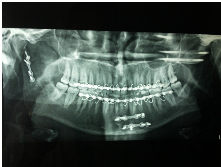
Fig 2 : Postoperative radiograph of patient in figure 1