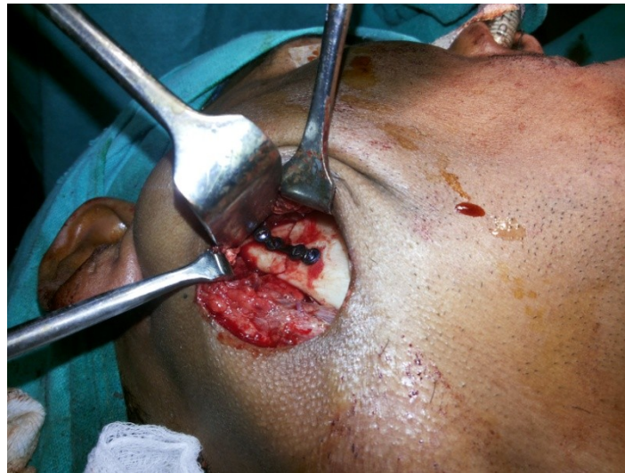
Fig 1 : Single miniplate fixation, Group I