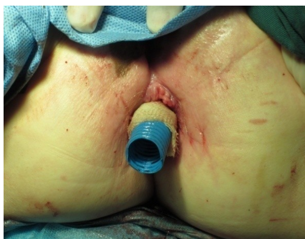
(Figure)2. Placed inside the anus and anal canal Decompression and drainage