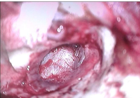
Fig. ii Graft placed by Underlay technique