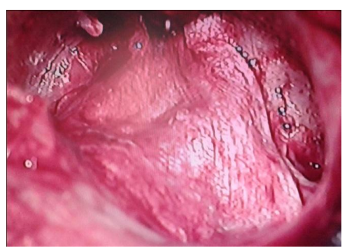
Fig. i Graft placed by Overlay technique