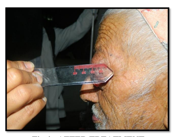
Fig 4: AFTER TREATMENT