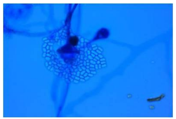
Fig 1 showing varying Sporangiospores

In conclusion it can be said that suspicion of a possible fungal etiology in all cases of fasciitis must be looked for and early diagnosis and proper antifungal therapy will save such patients