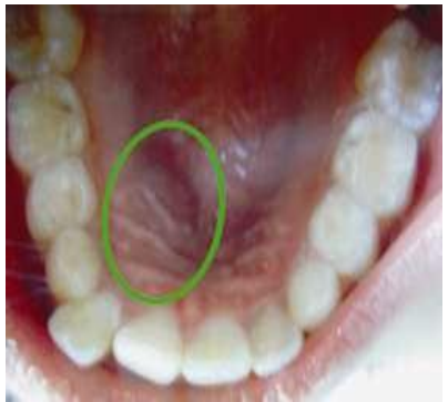
Figure 3: Vestibular obliteration on palatal aspect.