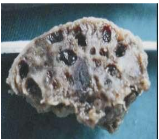
Figure 7: Cut surface shows micro- cavities in centre filled with brownish fluid.