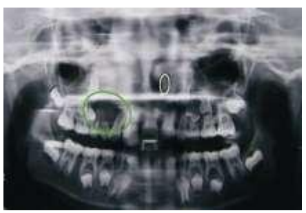
Figure 4: OPG Shows pathological root resorption with 53.