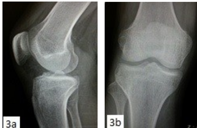
Fig 3a, 3b : Xray at 20 weeks post injury showing healed avulsion fracture

In our literature survey we came across only one case report of ACL and PCL avulsion fracture that too in a polytraumatised adolescent patient who was managed operatively [6]. Our case is different, as our patient was skeletally mature and had an isolated knee injury. Xrays followed by MRI were done to confirm our diagnosis. Conservative treatment was opted as it was Type 1 undisplaced ACL and PCL avulsion fracture. Regular clinical and radiological evaluation was done. Patient was kept nonweight bearing in a knee brace for 4 weeks. Progressive weight bearing and knee movements began at 4-6 weeks duration. He achieved full knee bending by 8 weeks. Xray and CT scan done at 20 weeks showed evident union of ACL and PCL avulsion fractures. ( Fig 3a, 3b; Fig 4a, 4b, 4c)