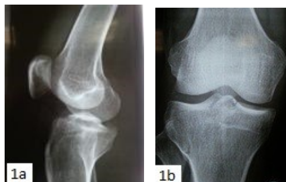
Fig 1a & b. Xrays showing avulsion of ACL and PCL from tibial insertion site

A 29 year old male presented to the emergency department following a motor vehicular accident on 4 July 2013. He met with a collision while driving his two wheeler at a speed of 50 kmph with another four wheeler and was thrown off from the vehicle. He sustained no other injuries except his right knee. On clinical examination, we found that he had significant effusion in the affected knee. He complained of pain in the knee, especially during active and passive extension of knee. There was tenderness at the posterior aspect of the knee. No neurovascular deficit was found. The knee was stable under varus and valgus stress. Both anterior and reverse lachman were positive. Under aseptic conditions the tense effusion was aspirated and 80 ml of blood was evacuated. Xrays taken at the emergency department showed avulsion fracture of both ACL and PCL as shown ( Fig 1a & 1b).