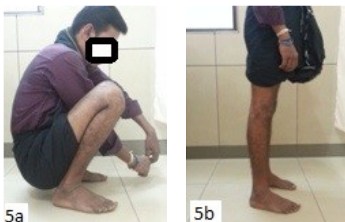
Fig 5a,5b : Clinical picture showing full ROM achieved after conservative treatment at 20 weeks

Clinical outcome of the patient was satisfactory at the end of 20 week (Fig 5a,5b). Early operative reconstruction of avulsion fractures of ACL and PCL are easy to perform and the results are better [7,8,9,10] However for an undisplaced avulsion fracture, we suggest nonoperative modality as advocated for isolated ACL / PCL avulsion fractures. Flexion (15-20 deg ) casting may not be necessary as previously advised. [11]