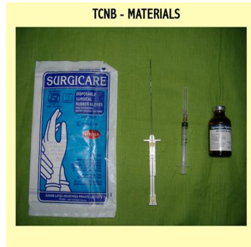
Fig.2 TCNB materials