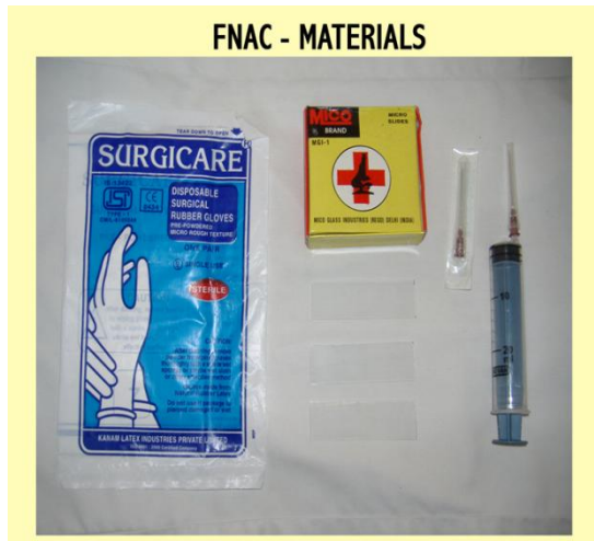
Fig.1 FNAC materials

The palpable lesion is fixed and skin is cleaned and then local anaesthetic is infiltrated .The needle is inserted and as soon as the lump is reached , the needle is advanced . Once the inner needle is inside the mass the outer needle is pushed and the whole trucut withdrawn. The material inside the stilllet is taken and sent for HPE.