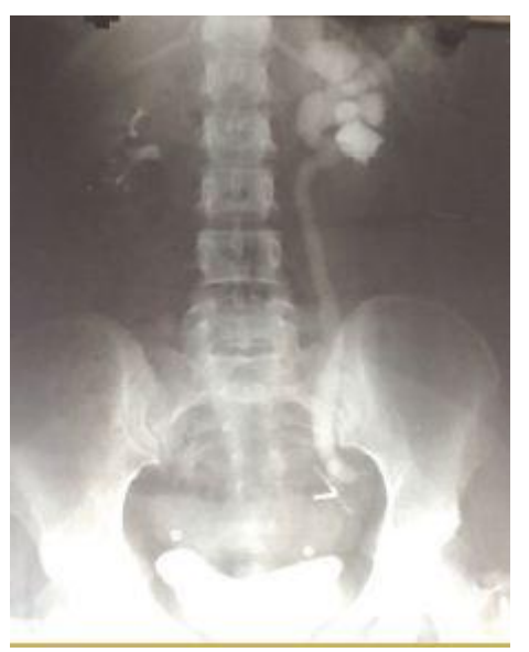
FIG 4 : Intravenous urography : revealed the presence of migrated IUCD causing extrinsic compression on left distal ureter causing hydronephrosis & hydroureter proximal to the site of obstruction