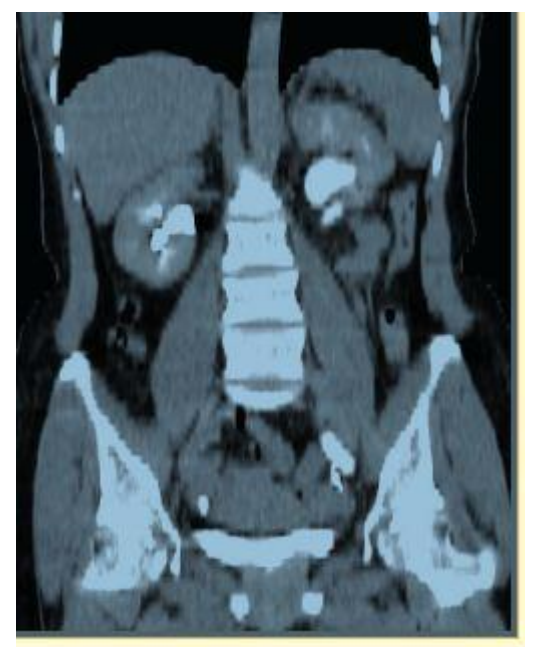
FIG\ 5\ (\ A\ )\ \&\ (\ B\ ): Contrast\ enhanced\ CT\ scan: Revealed\ \ the\ presence\ of\ migrated\ IUCD\ in\ the retroperitoneum\ causing\ extrinsic\ compression\ on\ left\ distal\ ureter\ leading\ to\ Hydronephrosis\ \&\ Hydroureter\ .