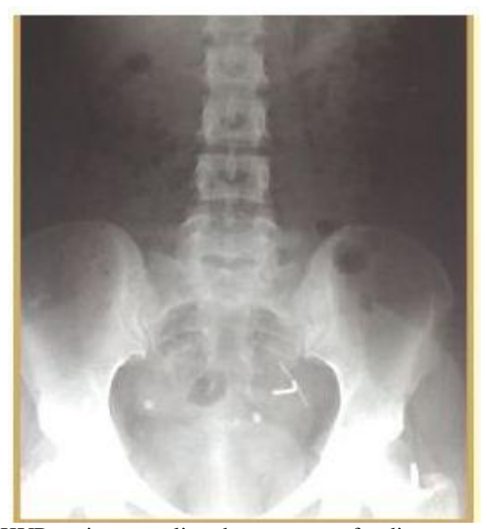
Fig 3: Plain Radiograph of KUB region revealing the presence of radio opaque T shaped IUCD in left side of pelvis inferior to left sacroiliac joint .Note the presence of bilateral tubal rings indicative of previous tubectomy .

DOI: 10.9790/0853-141210104 www.iosrjournals.org 2 | Page