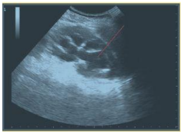
FIG 1: Moderate dilatation of pelvicalyceal system .No calculi seen