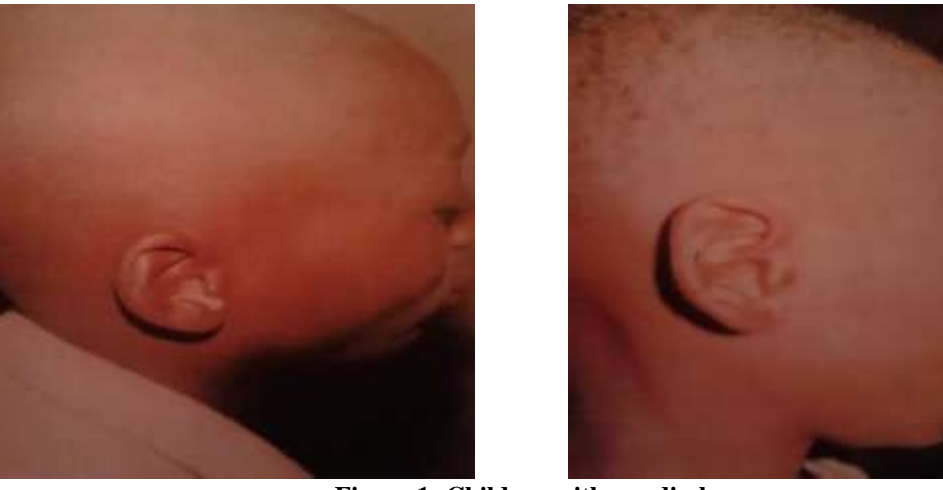
Figure 1: Children with ear discharge