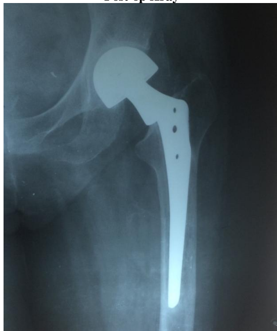
Post op 1 year