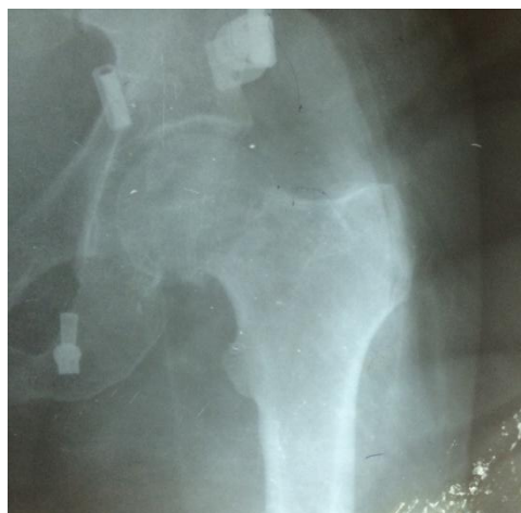
Pre op Xray