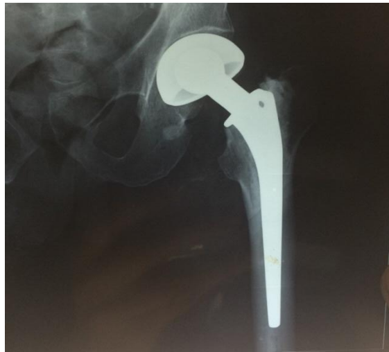
Post op X ray