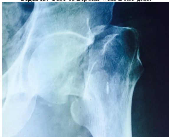
Pre op Xray