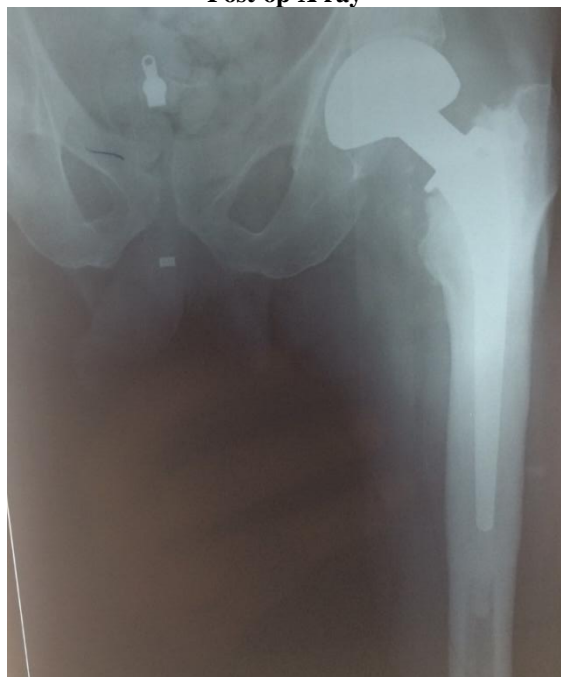
Post op 1 year