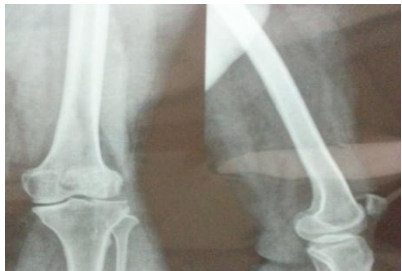
Fig.1: Radiograph of the Knee joint with thigh AP,Lat views