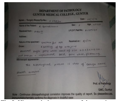
Fig.5: Histo pathology report of the specimen