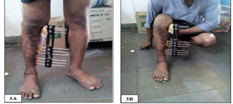
Fig 3: Clinical photographs showing (3A) Tibia postoperative with rail fixator with full weight bearing (3B) range of motion at knee and ankle with rail fixator.