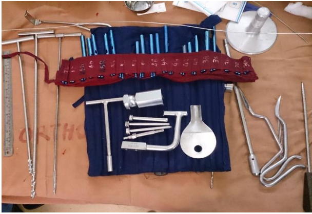
Implants and instruments