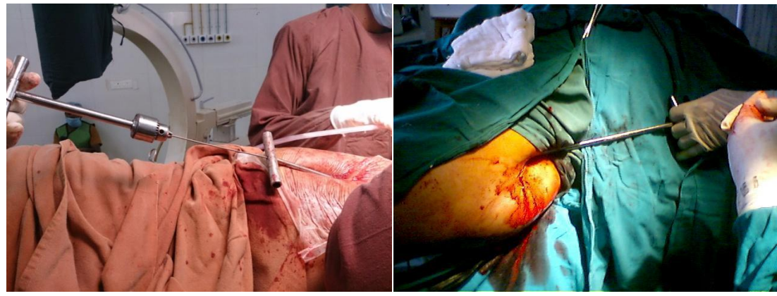
Guide pin insertion