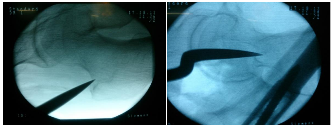
C arm image of entry point – AP view and lateral view