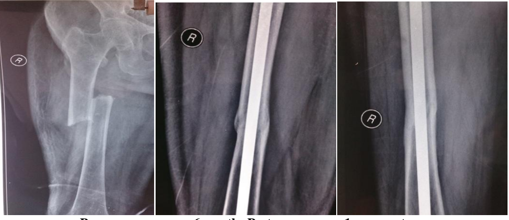
Pre-op 6 months Post op 1 year post op