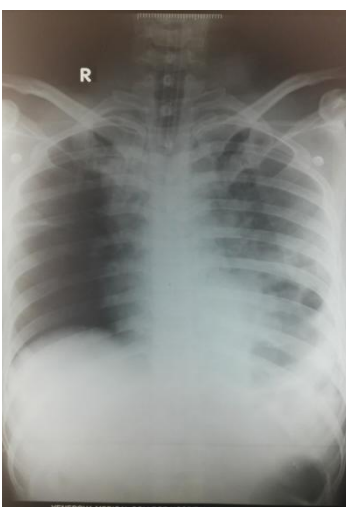
Chest X-ray(AP view) showing multiple ring like shadows in the left mid and lower zones.

asymptomatic of any respiratory and abdominal symptoms and was not willing for hernia repair he was send home after successful surgical correction of left iliac fracture.