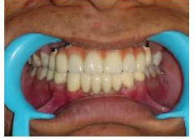
Fig- 19 Prosthesis after cementation