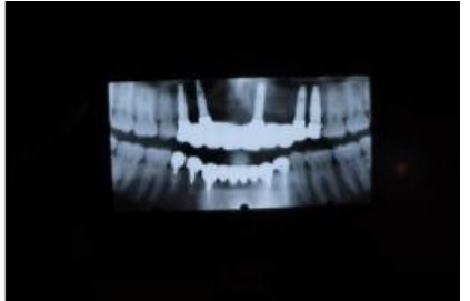
Fig-20 Post operative OPG