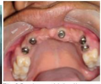
Fig-3 Implants with healing caps in maxillary arch