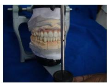
Fig-16 Abutments height verified Fig-17 Prosthesis prior to glazing