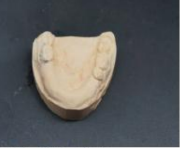
Fig-6 Mandibular cast