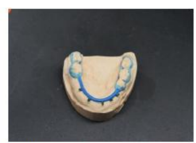
Fig-7 Hooks placed on the bar pattern Corresponding to 33, 34, 43, 44.

Rehabilitation Of A Case Of Traumatic Injury With Implant/ Post Supported Fixed Dental Prosthesis