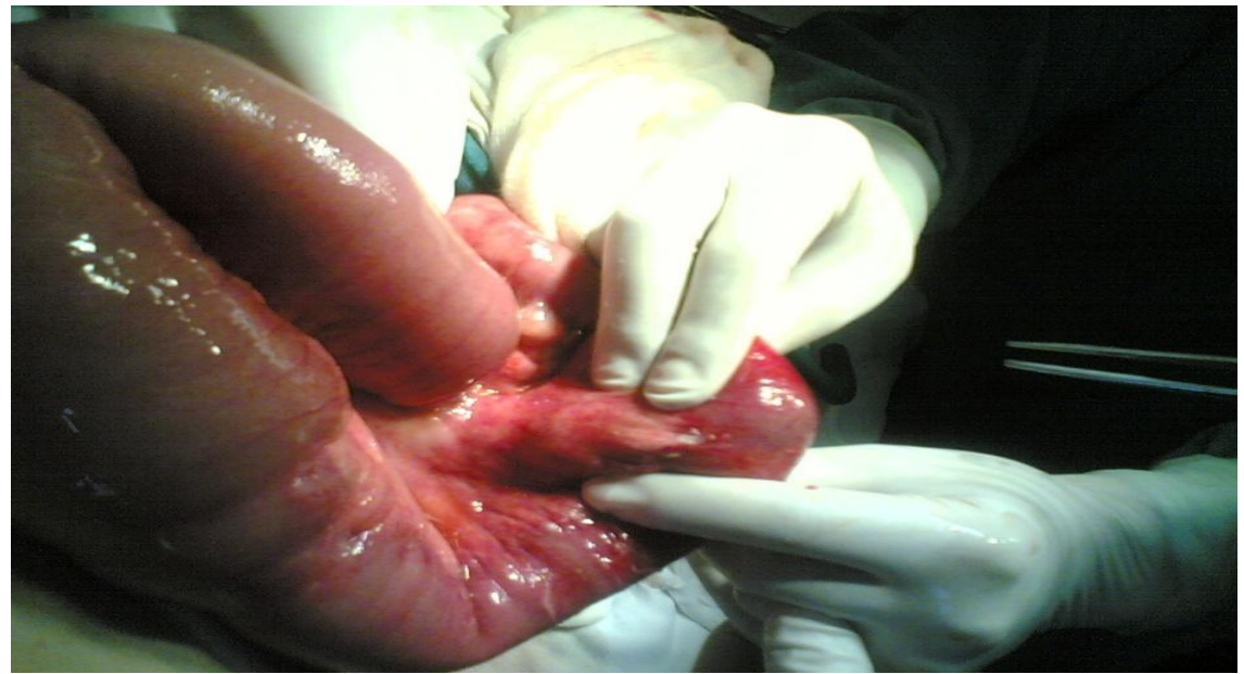
Figure-1 Showing dilated small gut loops proximal to a narrowed segment harbouring an enterolith

Laparotomy revealed normal stomach, duodenum and gall bladder with minimal turbid free fluid in the abdominal cavity. There was a dilated ileal loop proximal to a thickened and narrowed segment of it which was located approximately 2 feet proximal to ileocecal junction. An oblong hard structure was felt at the level of this stricturous narrowing from where it was milked in to the proximally dilated part of ileum(Figure 1).