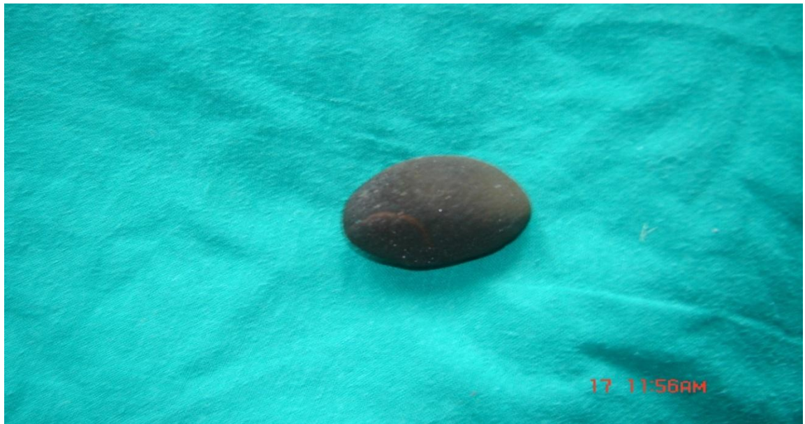
Figure- 3 The extracted enterolith