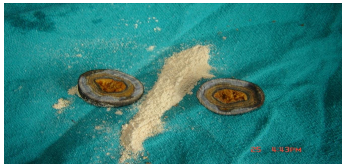
Figure -4 Cut section of the enterolith showing hard outer and soft brown inner core.