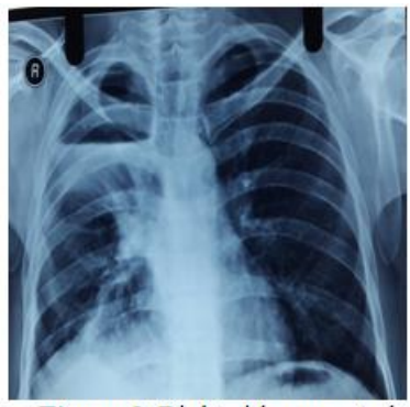
Figure 2. Right side encysted ydropneumothorax (During follow-up)

Figure 3. CT scan during follow-up shows liver abscess with right side loculated hydeopneumothorax