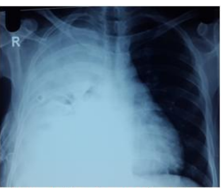
Figure 1. Showing massive right side Pleural effusion (at the time of admission)