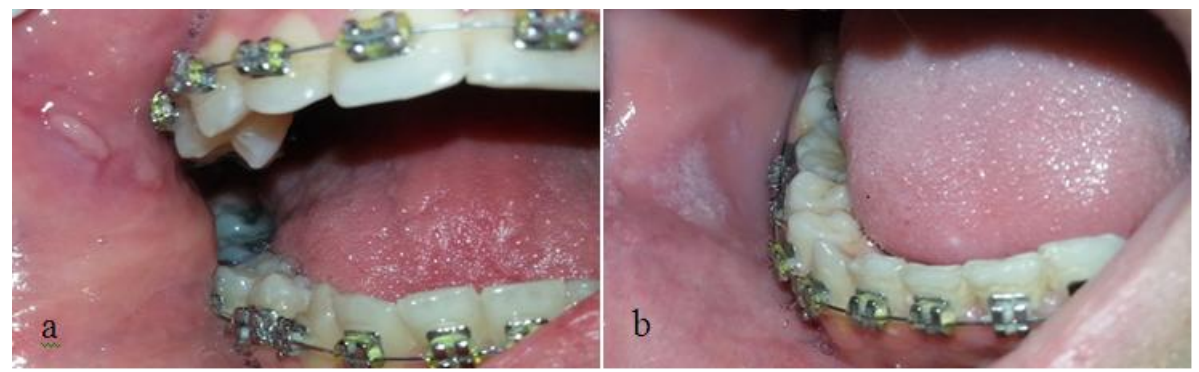
Figure(2):a:photographic picture from current study shows mucosal overgrowth. Figure(2):b: photographic picture from current study shows hyperkeratotic lesion HK associated with FLOA.

Patients were examined for evaluation and detection of any oral mucosal lesions - traumatic ulcers (TA), aphthous ulcers (AU), mucosal overgrowth (MO) and hyperkeratotic lesions (HK). Besides, a questionnaire-based study was used, questioning the participants about the history of TA, AU, MO and HK. They have also been questioned if those lesions appeared at the time of using the appliances and their emergence had any relation to the appliances or not. Moreover, all subjects were informed about the nature of their participation in this study and a consent form was signed by the participants after reading the content carefully. Ethical approval has been obtained from the University Research Ethics Committee, School of Dentistry –University of Sulaimani for conducting this clinical study.