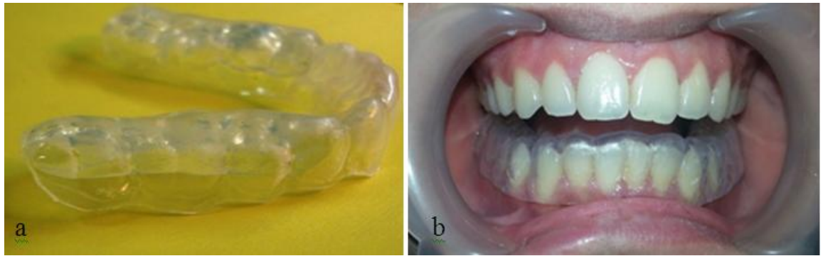
Figure (1): a: photographic pictures for manual invisalign appliances MIA. Figure (1): b: photographic pictures for patient with manual invisalign appliances MIA

Invisalign aligners are removable appliance permitting unimpeded oral hygiene. Furthermore, periodontal health and malodorous can improve during orthodontic treatment using the Invisalign system because patients can remove the aligners to brush and floss normally as well as cleaning the inner surface of the appliance. In contrast, fixed appliances create numerous plaque-retention sites that increase a patient's risk to develop demineralization (white spot), carious lesions and/or periodontitis<sup>[11]</sup>.