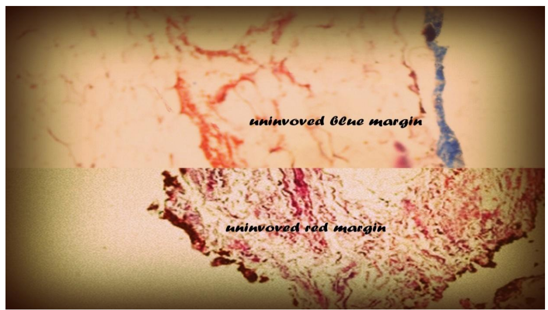
Fig 8. Picture showing microscopic appearance of re-excised specimen