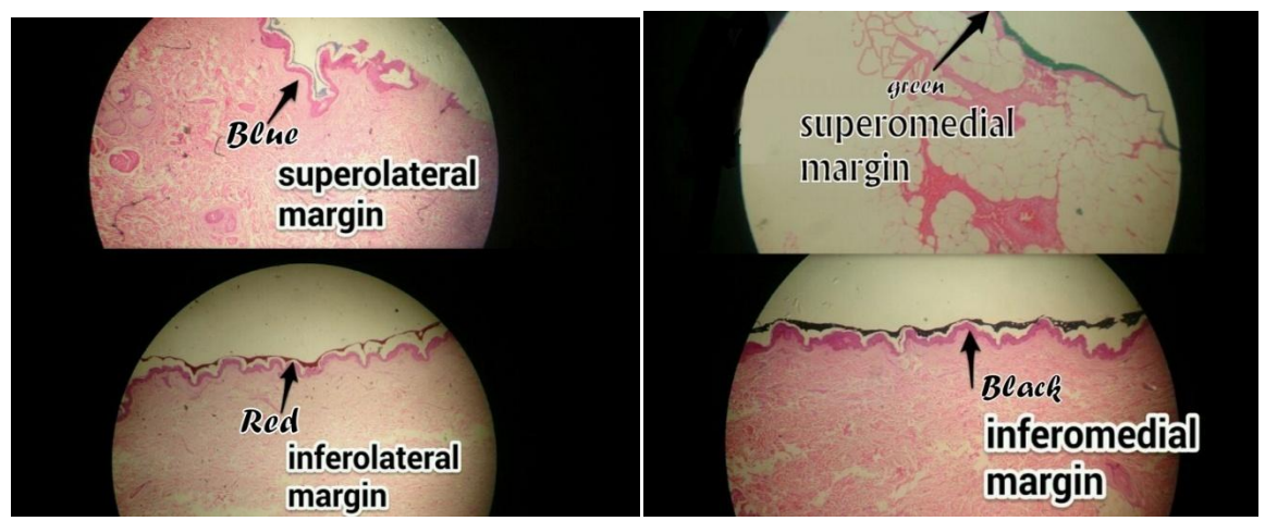
Fig.1-4 Pictures showing gross and microscopic appearance of painted surgical specimen