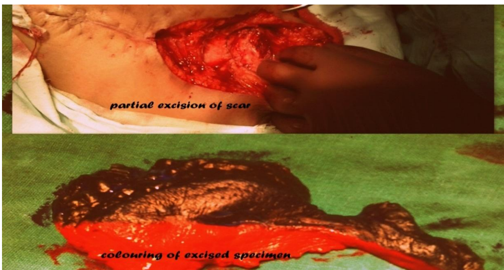
Fig. 7 picture showing re-excision and coloured specimen.