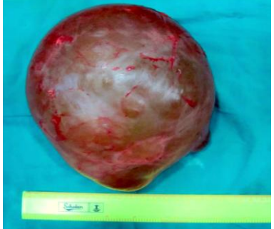
Figure- 6: Specimen of the cystic mass.

The cystic mass was sent for post-operative histopathology (Figure 6) which revealed that the wall of the cyst was lined by cuboidal epithelium. No malignant or dysplastic cell was identified (Figure 7). Immunohistochemical staining for S100, CD31 and calitirinin was done; and CD31 was found to be positive. Thus, the diagnosis of the omental cyst was confirmed.