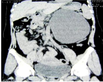
Figure-2: Axial cuts of CECT abdomen of same patient showing large cystic abdominal mass.