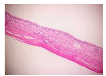
Figure- 7: Histopathology of cyst wall.