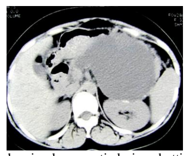
Figure-1 : CECT abdomen showing large cystic lesion abutting pancreas and left kidney.

A 30 year old female presented to our hospital OPD with abdominal distension and vague abdominal pain for last 6 months. A non-tender, globular lump having a diameter of 20 cm was noted in the left hypochondrium and epigastric region. It was smooth-surfaced, tense cystic in consistency with a very little mobility in any direction. The lump was intra-abdominal and retro-peritoneal fixity was not well appreciated by Knee-elbow test because of the large size of the lump. No other remarkable finding are there in physical examination. Her routine haematological and bio-chemical investigations like CBC, Fasting sugar, urea, creatinine and LFT was found to be within normal limits. Her serum CEA and CA-125 was also normal. Contrast enhanced CT abdomen revealed a well-circumscribed hypodense cystic lesion of 14.6cm x 14.8cm with incomplete septae extending superiorly abutting the body & tail of pancreas, inferiorly abutting the left kidney and anteriorly upto the anterior abdominal wall (Figure- 1,2).