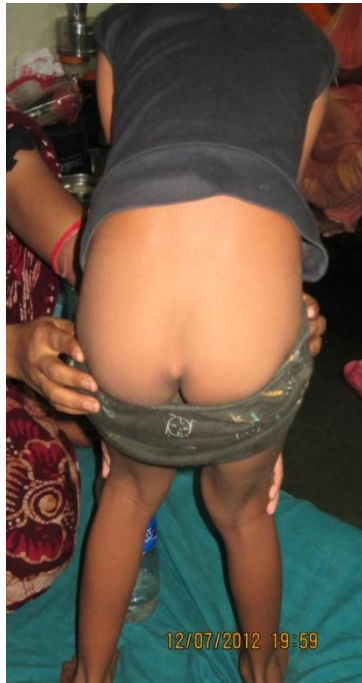
Fig 1 showing the human tail