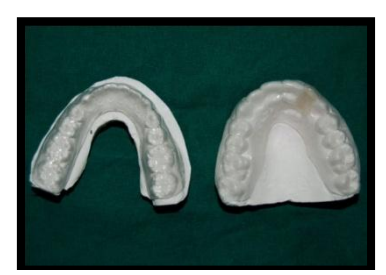
Fig 8: Clear Plastic Appliance