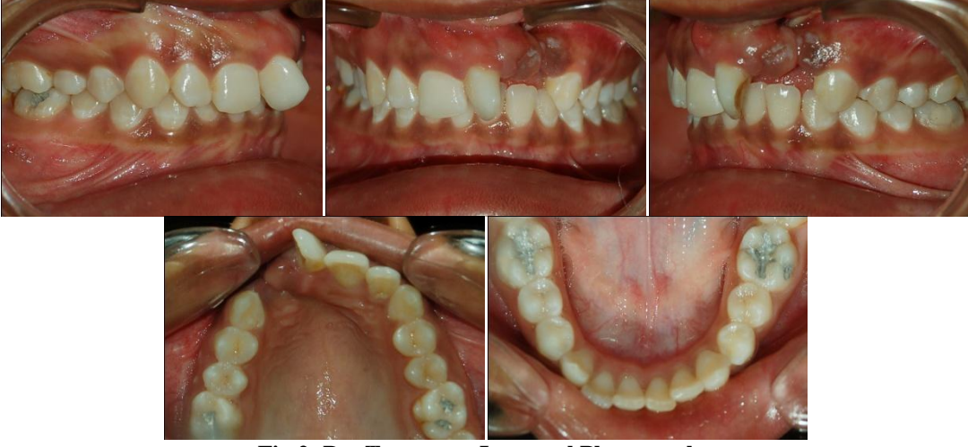
Fig 2: Pre Treatment Intraoral Photographs