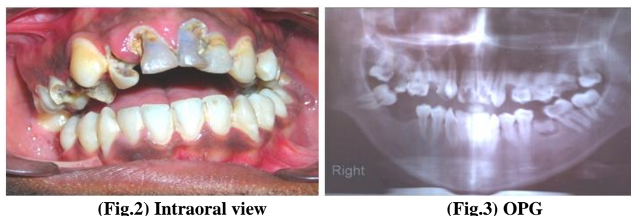
(Fig.2) Intraoral view

In the preliminary phase a careful clinical examination was carried out. Patient's extraoral examination revealed incompetent lips. Intraoral examination revealed poor oral hygiene, grossly carious maxillary anterior teeth with open bite. There was no tenderness on percussion, swelling, mobility or discolouration of teeth in the upper front teeth region. Clinical crown available was 0.5mm on distal aspect of 11 and 12 (Fig.2). Intraoral periapical (IOPA) radiograph showed periapical radioluscency in relation to 11 and 12 and the average diameter of the radioluscencies were 2mm mesio-distally. Also there was widening of periodontal ligament space w.r.t. 21 and 22. Radiographic examination with OPG was performed to rule out any other pathological conditions (Fig.3).