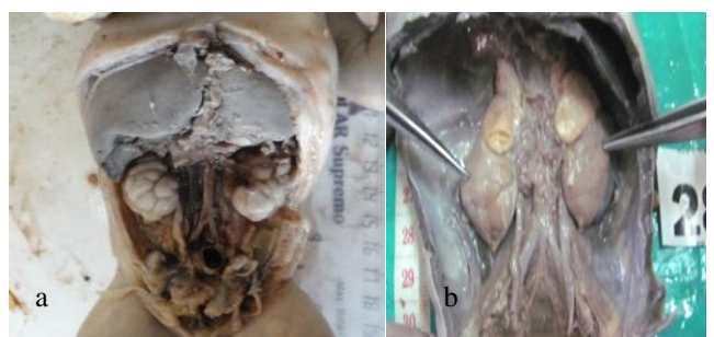
Fig 2: a) Foetus of 22 weeks of gestational age. Both the kidneys are in same level, lower poles are nearer than the upper poles, hila facing anteromedially. b) Foetus of 29 weeks of gestation. Right kidney is lower than the left kidney, lower poles are nearer than the upper poles, hila facing anteromedially.