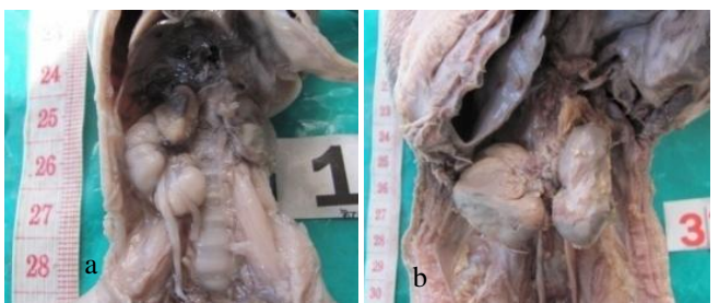
Fig 4: a) Foetus of 18 weeks of gestational age with left crossed fused renal ectopia. b) Foetus of 35 weeks of gestational age with superomedial (right) posteromedial (left) rotational anomaly.