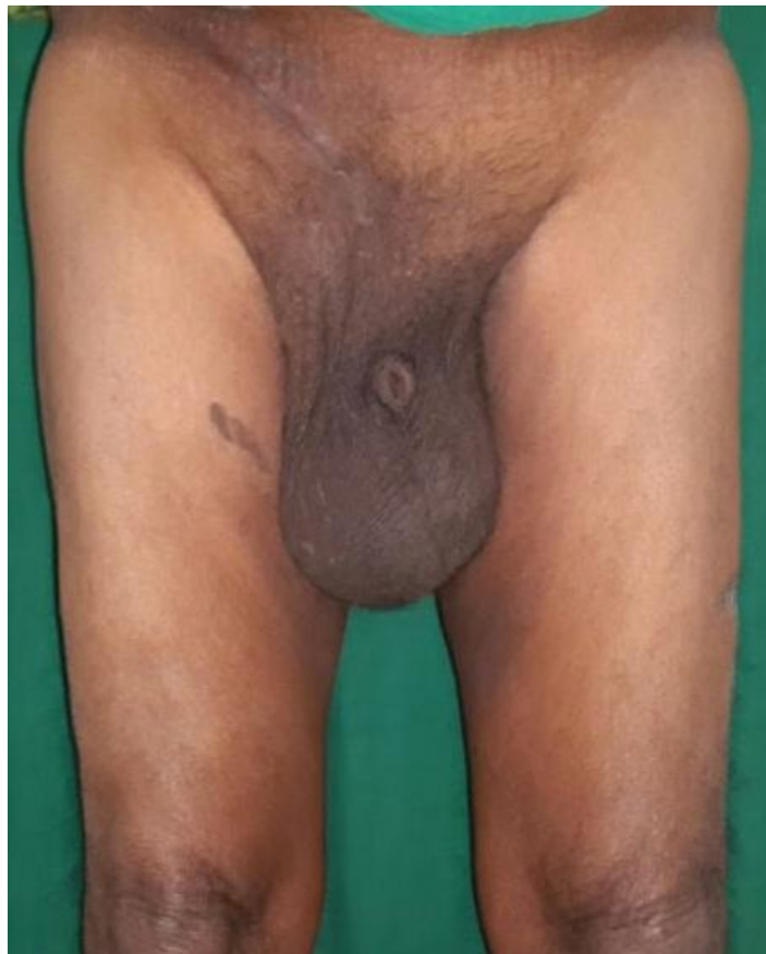
Fig 3 – Post operative healthy scar and retracted scrotal skin