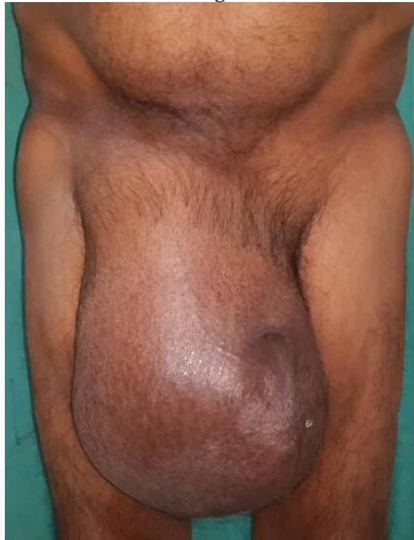
Fig 1 – Giant inguinal hernia with buried penis , reaching just above right knee.