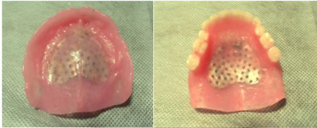
Final finished and polished denture

1.1.3 On the next appointment denture insertion is done strictly following the denture insertion protocols as well as post insertion instructions is given to the patient. The patient is reviewed 24 hours post insertion and examined as well as patient opinion is recorded. Recall visit also done after 1 week intervals and the denture is inspected thoroughly for fracture lines. No evidence of craze lines is evident and denture is functioning well under the occlusal loads of opposing natural dentition even after one month recall visits.