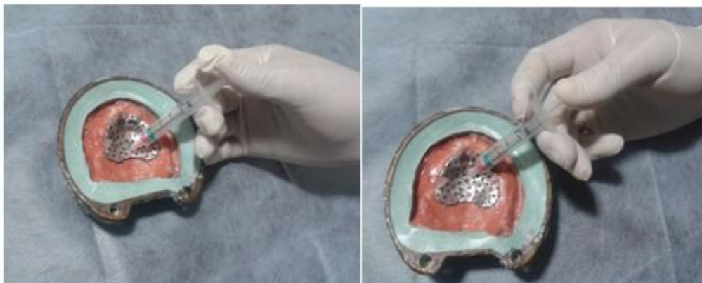
Loaded self-cure acrylic is syringed through the tray-hole

2.2.4 Self-cure acrylic material is then mixed following manufacturers recommendations and it is loaded on to a syringe. The material is then injected through the tray hole immediately adjacent to the position of the wax block for holding the tray in position while packing as well as maintaining the space beneath. The acrylic material is allowed to set and once it is set the wax sheet beneath the tray is removed using fine forceps. Now the tray is resting on self-cured acrylic pillars on 4 separate points with a space of 0.8mm beneath for the heat cure acrylic material to flow while final packing.