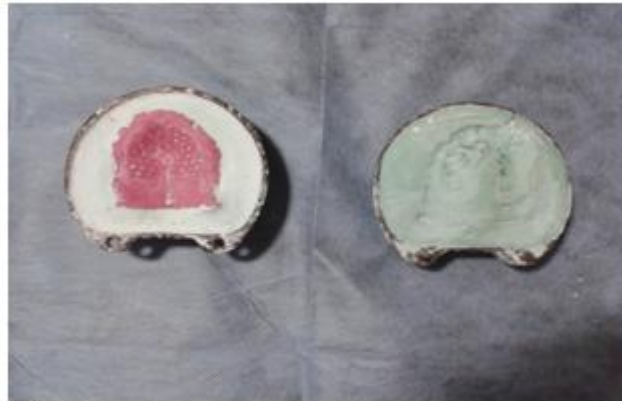
Self-cured duplicated cast after de-flasking

2.2.3 The flask is then removed from the bench press and opened to check for the accurate adaptation of the trimmed tray conforming the contours of palate 3 dimensionally. The adaptation is finally evaluated on the master cast too.