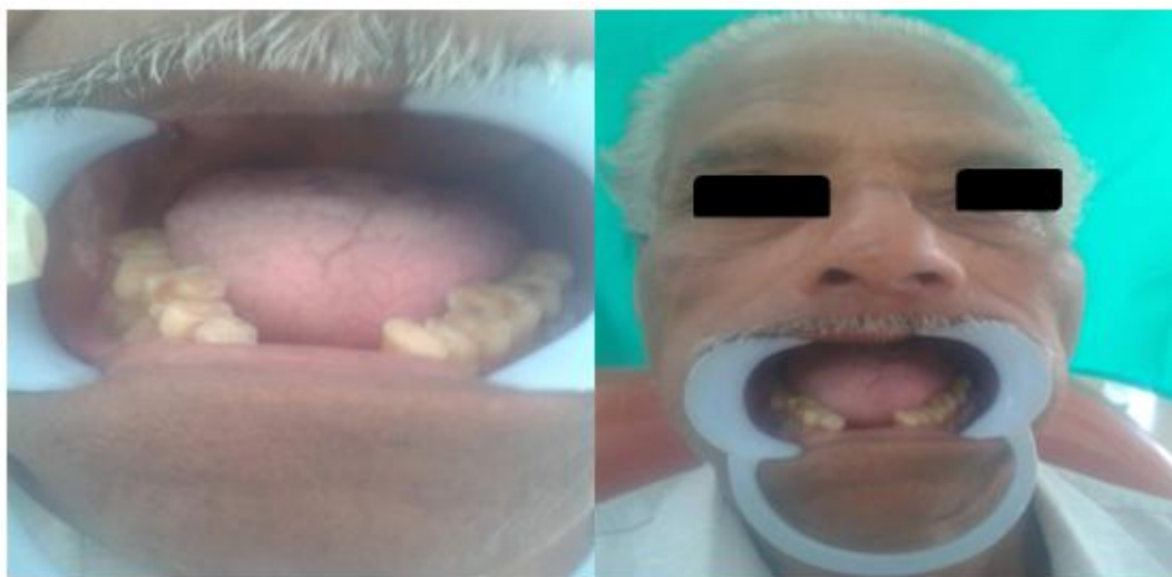
Completely edentulous maxillary arch opposing remaining mandibular natural dentition

65 year aged male patient reported to the OP in Azeezia College of Dental Sciences and Research with chief complaint of repeated fracture of the maxillary Denture. The patient had been a denture wearer for the past 5 years and already had 3 dentures which got repaired for fracture. On examination the patient is found to be a single complete denture wearer with Maxillary complete denture opposing mandibular natural teeth. The previous denture were also inspected and detailed history were taken about the Para functional habits, dietary habits, denture cleansing and the fracture pattern of denture. The patient has not reported any Para functional habits and he is under normal mixed diet too.