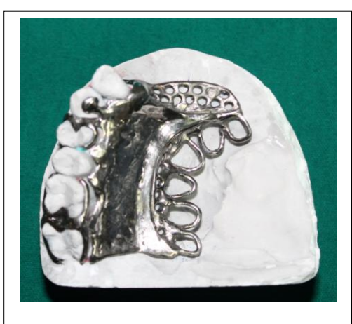
TITANIUM FRAMEWORK-METAL TRYIN

A secondary cast was poured with type 4 gypsum product. Shell wax pattern of 2mm thickness is fabricated in the defect portion. Wax pattern for the lid to close the defect is fabricated. Both hollow bulb shell portion and the lid portion is flasked, dewaxed and processed with heat cure denture base resin (DPI HEAT CURE, INDIA). The bulb and lid were trimmed and polished. After verification of fit of bulb and lid intraorally, both were fused using chemically activated denture base resin. Titanium framework was made on the cast and metal try-in was verified.