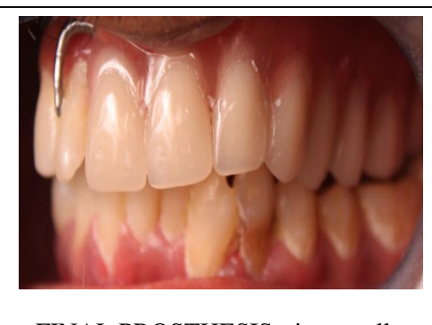
FINAL PROSTHESIS - intraorally

After insertion of the prosthesis, patient's speech was examined. Patient was comfortable with no leakage of air during speech and no nasal regurgitation of fluids. Denture was found to be stable and retentive which might be due to engagement of bulb in the anatomic undercut and retentive clasps on the other side.