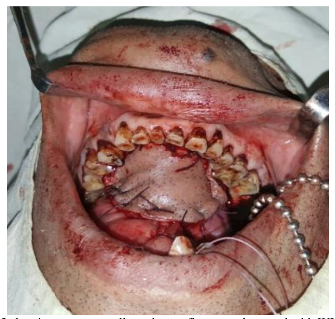
Fig-3 showing squmous cell carcinoma floor mouth treated with WLE

All the operated cases were average hospital stay fifteen days. Among the operated cases 1 patient had recurrence. 1 patient treated with adjuvant radiotherapy post-operatively.