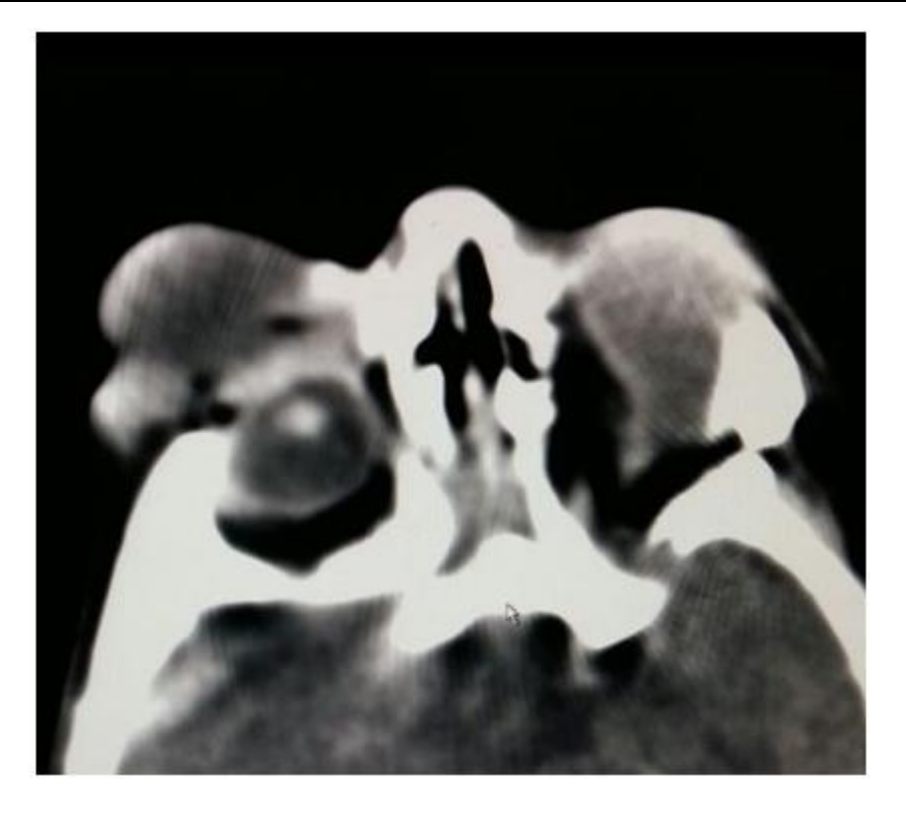
Fig 3:- Axial contrast enhanced CT of bilateral orbits demonstrates the bilateral cystic lesions within the orbit with no peripheral and internal contrast enhancement. Note the right eye microphthalmos