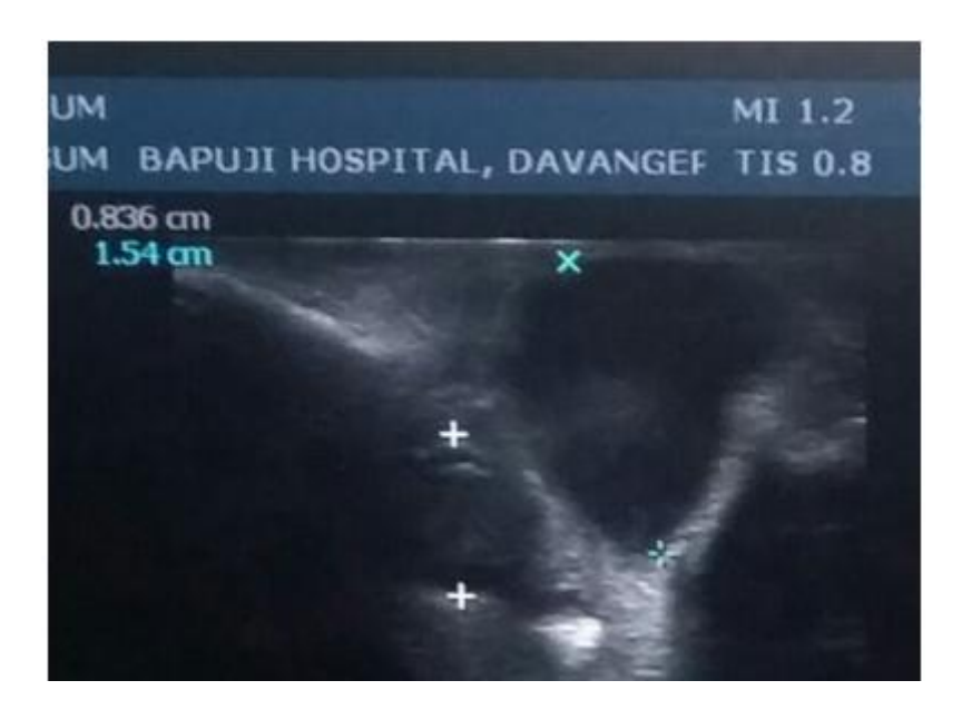
Fig 2:-b mode ultrasound scan of the left eye shows well defined anechoic cystic lesion measuring 1.5x1.2cm inferolateral to the globe with microphthalmos . Note the defect in the posterior part of the globe which communicated with the cyst wall cavity