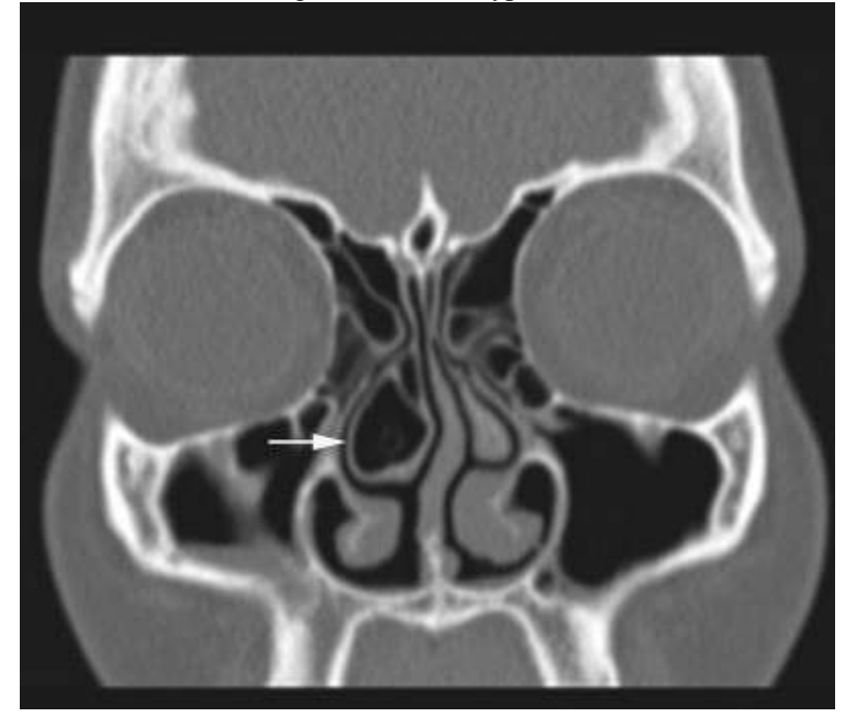
Figure 2: bulbous type CB