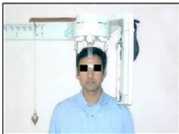
(Fig: 1- A patient with natural head position)

(Fig:1) The radiographic apparatus used was Orthoralix 9200 cephalometer. The Kodak x-ray films of 8" x 10" were used. All lateral cephalometric radiographs were taken in centric occlusion with lips in repose and the Frankfort horizontal plane oriented horizontally according to natural head position. The True Vertical Line was made by a thin steel chain hanging from the X-ray machine.