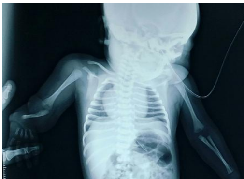
Figure 2: Infantogram showing absence of radius bone (right side)