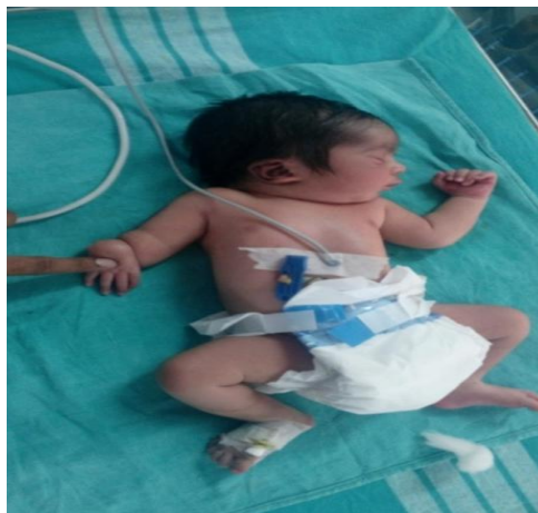
Figure 1: Baby showing absence of radius and right thumb

The birth weight was 2.67kgs with length 48cm and head circumference of 35cm. Baby was active and had normal neonatal reflexes. Clinical examination revealed single umbilical artery, scoliosis towards right side, and absence of radius and thumb on right hand [Figure 1]. Oral and anal orifices are patent.