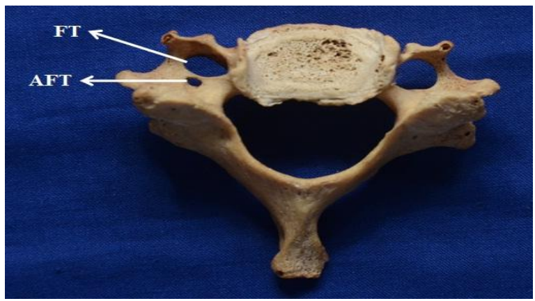
Fig-3: Unilateral Accessory Foramen Transversarium in C7 vertebrae.

Out of 50 numbers of C7 vertebrae, 7 (14%) had Accessory foramen transversarium. In these 7 vertebrae, 3 (6%) had Unilateral Accessory foramen transversarium. Among these 3, one (33.3%) vertebra had Accessory foramen transversarium on Right side, 2 (66.6%) vertebrae on Left side. (Fig-3)