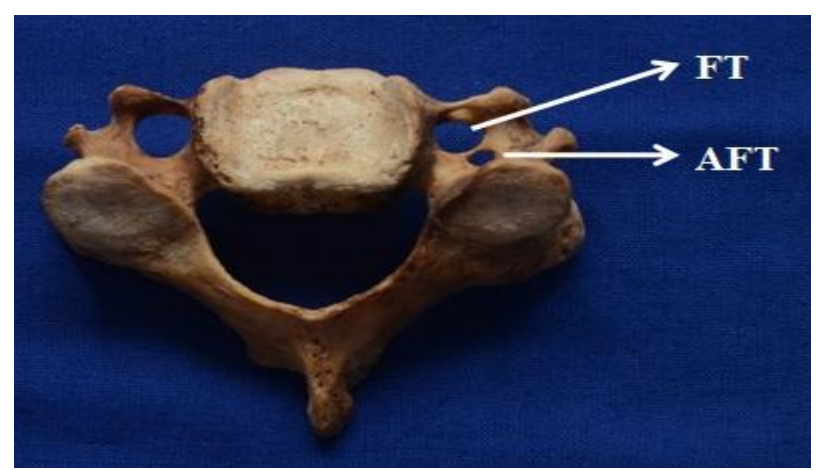
Fig-1: Unilateral Accessory Foramen Transversarium in C3 –C6 Vertebrae.

FT- Foramen Transversarium, AFT -Accessory Foramen Transversarium. Among 120 numbers of C3 –C6 vertebrae, 8(6.6%) were found to have Bilateral Accessory foramen transversarium.(Fig-2)