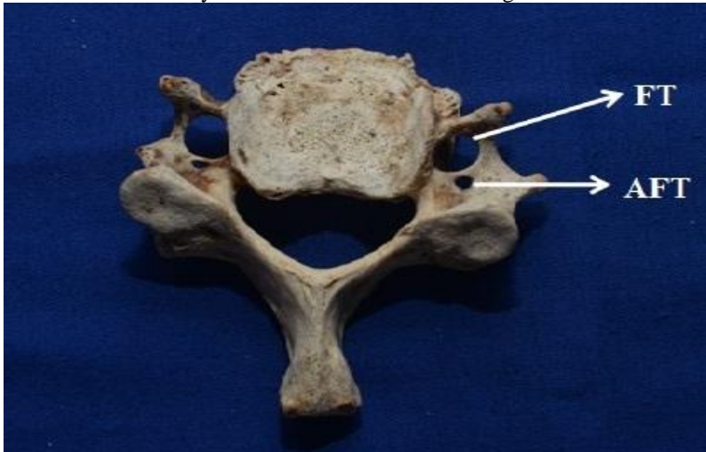
Fig-4: Bilateral Accessory Foramen Transversarium in C7 vertebrae.

4 (8%) vertebrae had Bilateral Accessory foramen transversarium among 50 numbers of C7 vertebrae. (Fig-4)