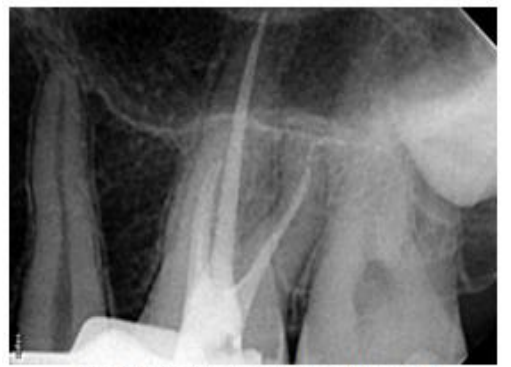
Fig.3 Master cone fit radiograph.

Fig.2 Working length determination radiograph