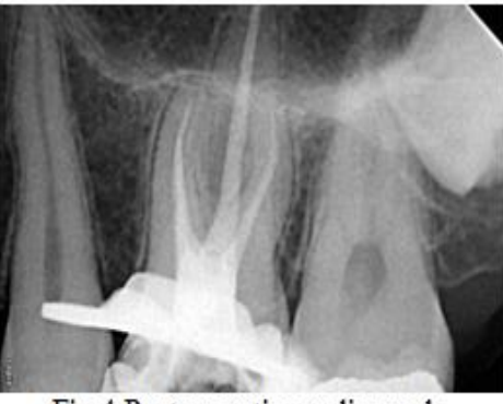
Fig.4 Post operative radiograph.