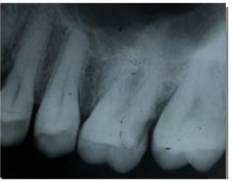
Fig. 1 Preoperative radiograph of 26

mesiobuccal orifices. Careful examination and exploration of the groove with a DG 16 explorer which resulted in the detection of an extra mesiobuccal canal which was roughly about 2-3 mm away from the MB1orifice and with the help of small sized instruments (6, 8, 10 Mani K-files) the canal was negotiated and The working length was determined with the help of an apex locator and later confirmed using a radiograph, palatal – 23. 5 mm , MB 1 – 19.5mm, MB 2 – 19.5 mm , Distobuccal – 19 mm( FIG .2), Cleaning and shaping was done using rotary instruments (Protaper next SX,S1,S2 ,F1,F2) with crown down technique . Irrigation was performed using normal saline, 2.5% sodium hypochlorite solution, and 17% EDTA , 2% chlorhexidine digluconate was used as the final irrigant . and Gates Glidden drills (sizes 3, 2, 1) (fig.3). The canals were dried with absorbent points and the canals were obturated using AH plus sealer and cold lateral compaction of gutta-percha the tooth was subsequently restored (fig 4).