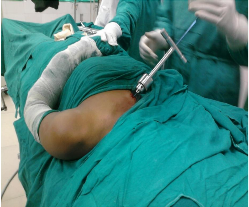
Fig 1: Method Of Inserting Nail From Medial Side Of Clavicle

All the patients were put in a shoulder sling postoperatively and followed same rehabilitation regime of early gentle mobilization when pain allows, with no overhead abduction for first two weeks. The shoulder sling was discarded at 2 weeks and active-assisted exercises were started, but the patients were advised not to lift any heavy object for 6 weeks. At that time, passive and strengthening exercises were started.