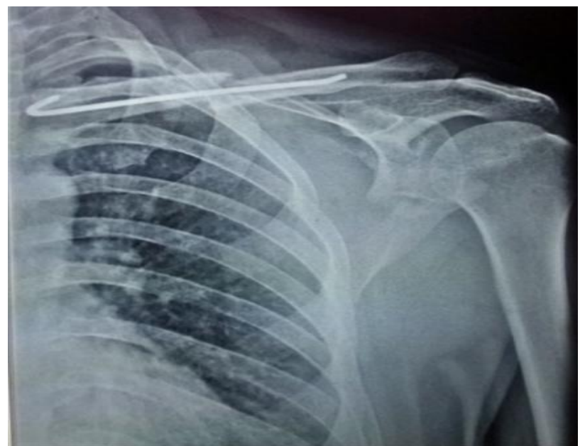
Fig: 3 Post-Op Xray 30 Yr Male With Fracture Clavicle And Scapula Left Side, Clavicle Fixed With Tens Nail