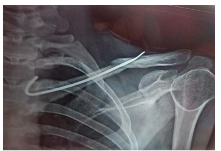
Fig: 8 Perforation of lateral cortex