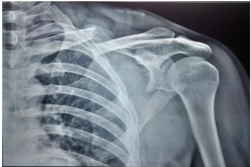
Fig: 2 Pre-Op Xray 30 Yr Male With Fracture Clavicle And Scapula Left Side