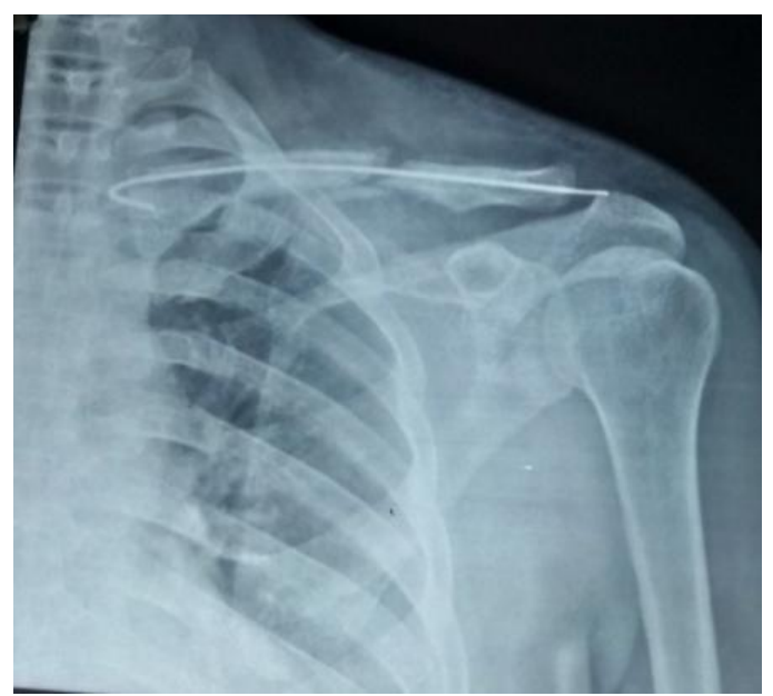
Fig: 7 Lateral migration of nail