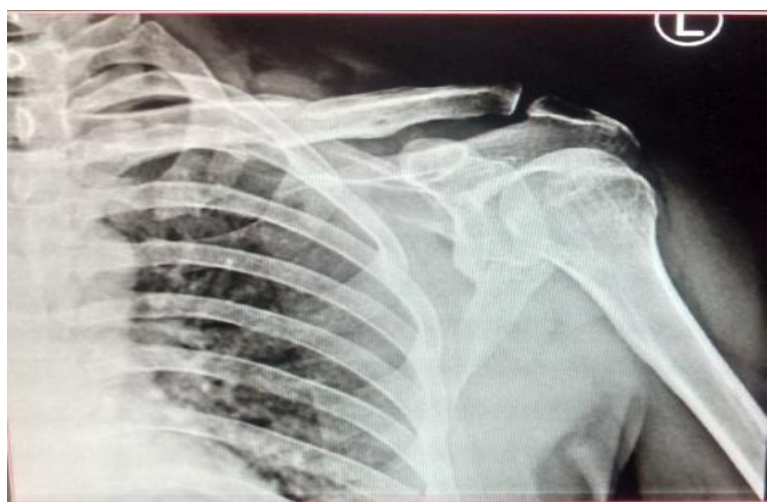
Fig: 4 14-week post-op xray 30 yr male with fracture clavicle and scapula left side after-union TENs nail removed