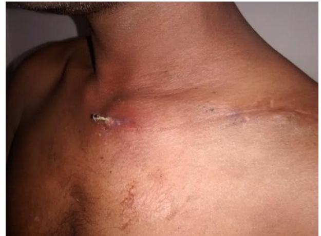
Fig: 9 Pin Tract Infection

Functional outcome was assessed by the Constant score. In the Constant scoring system, the overall grading is excellent if the total score ranges from 90 to 100, good for 80-89, fair for 70-79, and poor if the scores are 69 or less. At final evaluation, the overall results using the constant score were 38 excellent and 12 good results.