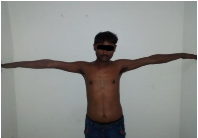
Fig: 5 Shoulder ROM After 8 Week Post Fixation