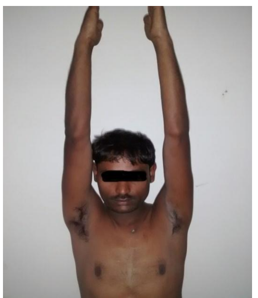
Fig: 6 Shoulder ROM After 8 Week Post Fixation