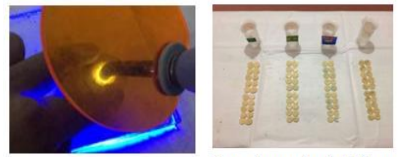
Figure 3: curing of specimen Figure 4: samples divided into 4 groups

Specimens were made from the composite using a rubber mould that is having a well diameter of 15mm and a depth of 2mm. The rubber mould was open on both sides. A glass plate was fixed on to a table and above that, the mould was placed (fig.1). Composite was packed into the mould using composite placement instrument (GDC) (fig.2). The mould was slightly over-filled with the composite. After placement of composite, mylar strip was placed over it. Another glass plate was placed over the mylar strip and it was pressed to get rid of the excess composite. Then the composite was light cured for 30 seconds on the operator facing side of the specimen. The other side of specimen was then cured for 30 seconds (fig.3). Curing of the specimens was done by using Monitex, Bluelex GT1200. After curing, the specimens were polished using medium, fine and superfine polishing discs in a sequential manner (Sof-lex, 3M ESPE). The polished specimens were cleaned in distilled water for 2 minutes to remove any surface contaminants. All discs were stored in 37°C distilled water for 24 hours.