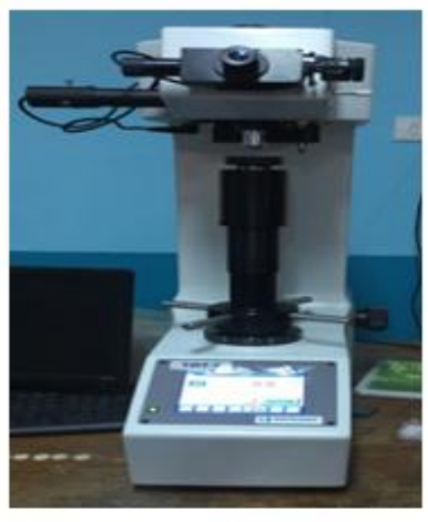
Figure 5: hardness testing machine, Matsuzawa, Japan