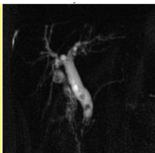
Fig 2: CBD Stones With GB Stump