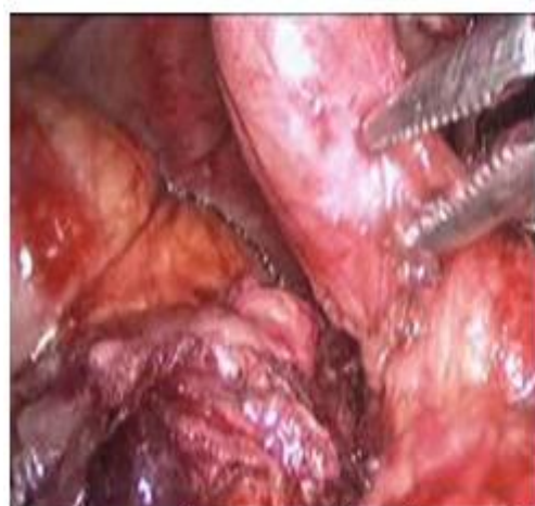
Fig 6: Cystic Artery Being Dissected