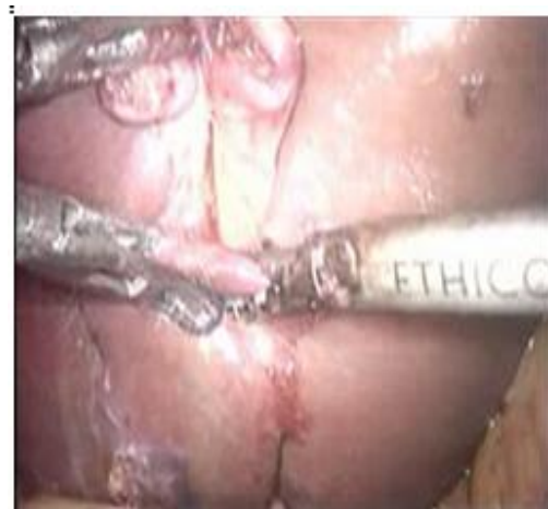
Fig 4: Liver Dissected To View The GB