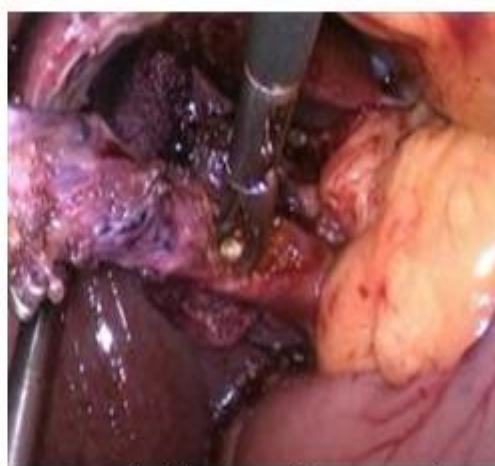
Fig 7: Calculi Extracted From Cystic Duct