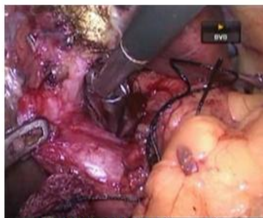
Fig 4: Calot's Being Dissected