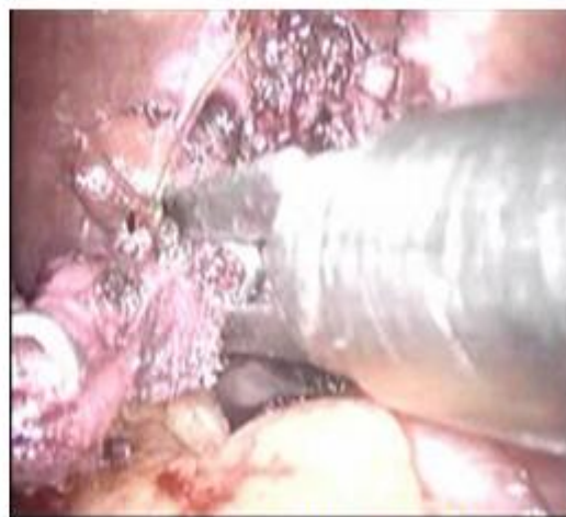
Fig 9: Cystic Duct Being Clipped