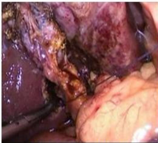
Fig 8: Cystic Duct Being Ligated