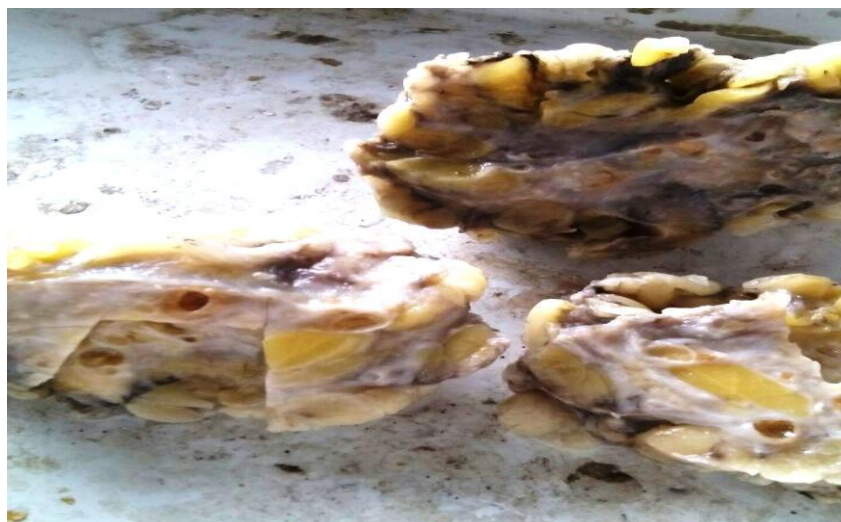
Fig.1: Gross specimen: Showing cysts and calcified nodules of varying sizes.