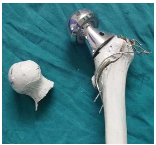
Fig 5. Calcar reconstruction with anatomically aligned commented bipolar, Tension band wiring done which increases stability with abductor mechanism being retained.

All procedures were done under epidural analgesia in lateral position, approach was anterolateral. Iliotibial tract was cut vastus lateralis was split anterior 1/3 and posterior 2/3, anterior capsule was elevated, extracapsular fracture was converted to intracapsular fracture (another proximal fracture was made to fracture). Femoral Head was excised distal fracture fragment was aligned well with femur. Through medial to greater trochanter entry point to femoral canal and was prepared. Anteversion maintained to calcar line or in axises of medial condyle, after checking head size cemented bipolar done in proper version. Length offset kept in position till cement settled well. Tension band wiring performed from tip of trochanter to medial aspect femur below fragment. Thus trochanter and abductor mechanism retained. Joint was reduced .For all patients greater trochanter was fixed with tension band wiring except one patient, where greater trochanteric fracture was horizontal, cirulage was done for that patient. Stability was checked. Wound closed with drain.