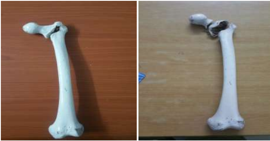
Fig 3.Intertrochantric fracture.

trochantric fractures with impending avulsion for all patients with osteoporosis. There was no significant blood loss during surgery. Cefperazone with salbactum combination was used up to 8gm of injections, for next four days oral antibiotics were used.