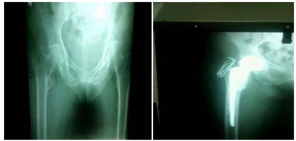
Fig 6 . Pre op intertrocantric fracture.