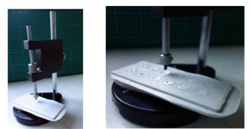
Figure 1. Modified Vicat apparatus-left and right-positioned Paris mold during the experiment.