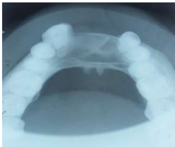
Fig 5. Anterior mandibular true occlusal view

FNAC, smear showed two clusters of basaloid cells with hyperchromatic nuclei and minimal cytoplasm, loose fibrillar stroma with minimal inflammatory cells. Some scattered squamous epithelial cells were also seen. Features were suggestive of a lesion of odontogenic origin. Incisional biopsy was performed which was followed by wide excision. Gross specimen showed soft tissue which was pearly white in colour with underlying brown areas. It was slimy in nature and had soft jelly like consistency. Microscopy revealed serial sections of H & E stained tissue showing spindle and stellate shaped cells present in a mucoid stroma. The spindle shaped cells were widely dispersed with elongated and delicate cytoplasmic cell processes. The collagen fibrils were very delicate. Stellate shaped cells were seen traversing between the muscle fibres. Perivascular hyalinization, minimal inflammatory cells and occasional mast cells were also seen. Submucosa showed skeletal muscle fibres and adipocytes. Microscopic features were suggestive of Odontogenic myxoma. (Fig 6 and Fig 7)