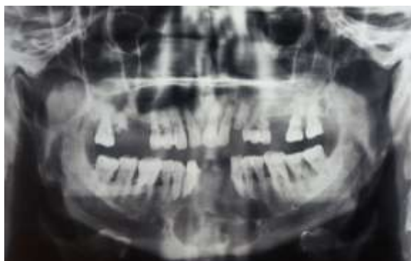
Fig 3: Panoramic radiograph showing multilocular radiolucency in 35-44 region

Panoramic radiograph showed a multilocular radiolucency of size approximately 5x4 cm in mandibular symphyseal parasymphiseal region, crossing the midline, extending from 35 to 44 region with well defined corticated border inferiorly. The lesion was approximately 0.5cm above the lower border of the mandible and superiorly it perforated the superior border of mandibular alveolar ridge. There was no root resorption or displacement of adjacent tooth (Fig 3).