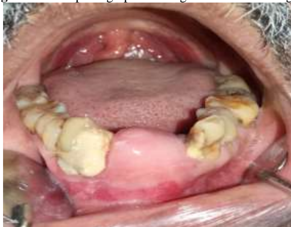
Fig.2 Intraoral photograph showing well defined swelling in alveolar ridge of 32-42 region.

Panoramic radiograph showed a multilocular radiolucency of size approximately 5x4 cm in mandibular symphyseal parasymphiseal region, crossing the midline, extending from 35 to 44 region with well defined corticated border inferiorly. The lesion was approximately 0.5cm above the lower border of the mandible and superiorly it perforated the superior border of mandibular alveolar ridge. There was no root resorption or displacement of adjacent tooth (Fig 3).