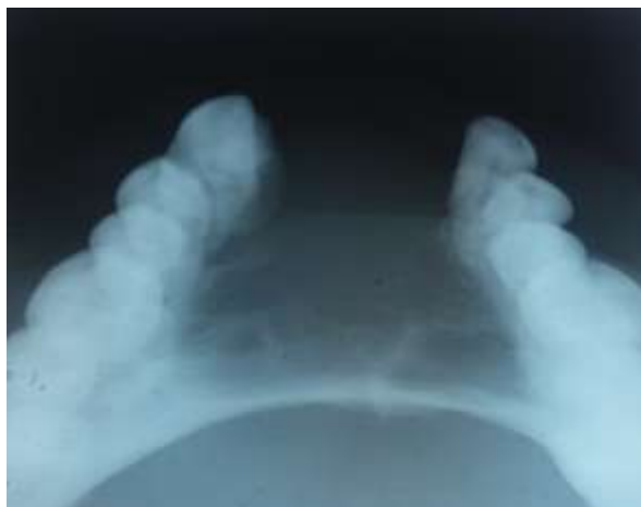
Fig 4. Mandibular anterior topographic occlusal radiograph showing angular internal loculations

Anterior mandibular topographic occlusal view showed well defined straight, thin and sharp angular internal loculations which were more pronounced towards the inferior border resembling a tennis racket pattern. Superior border was perforated. (Fig 4) No obvious labial or lingual cortical plate expansion was noted in anterior mandibular true occlusal radiograph. (Fig 5). Based upon the radiographic findings, a differential diagnosis of odontogenic myxoma, ameloblastoma and central giant cell granuloma were made.