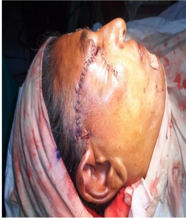
Photo 4: Intra op photo showing suture in situ with good suture line.