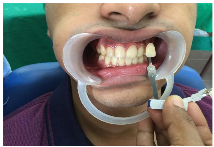
Figure3: Shade selection done for appropriate veneer fabrication