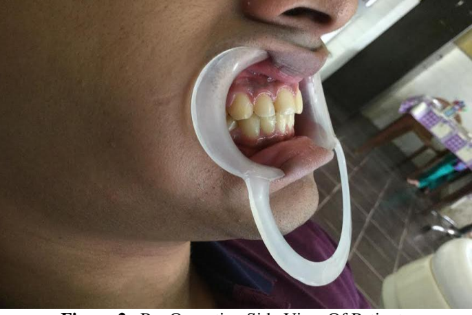
Figure 2 Pre Operative Side View Of Patient