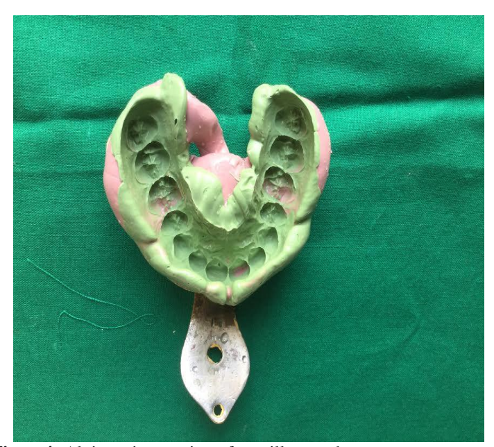
Figure4: Alginate impression of maxillary arch